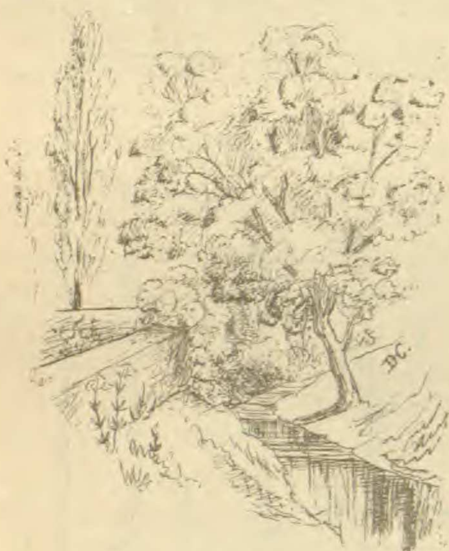
IN THE GARDEN.